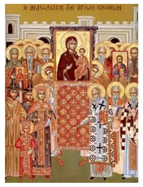
Неділя 21 лютого 2021 Перша Неділя Посту