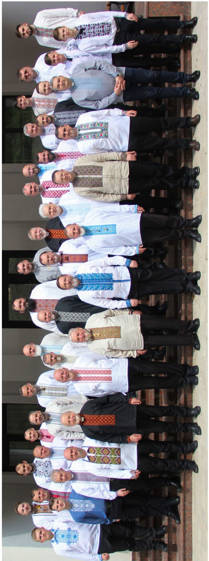
A Male choir? Waiters at that great new mega Ukrainian restaurant? No! These are the Ukrainian Catholic Synod of Bishops [in Ukraine], not the full global Synod]. They were holding sessions when Vyshyvanka Day arrived (May 18) and they decided to show their spirit by donning embroidered shirts and posing for a picture! [Not all are bishops, some are priests who were giving reports and seminarians who were serving on staff, but - most are our Bishops in Ukraine's 18 eparchies/exarchates]