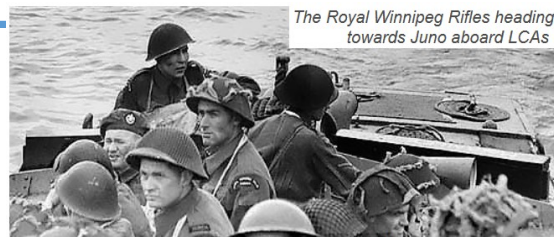
The Royal Winnipeg Rifles heading towards Juno aboard LCAs

Mon., June 5 6:30 a.m. - Holy Rosary Priest Martyr Dorotheus 7:00 a.m. Divine Liturgy... For all those Romans 2:28-3:18 willing to fight for the dignity & freedom Matthew 6:31-34, 7:9-11 of all people (the eve of D-Day, 1944)