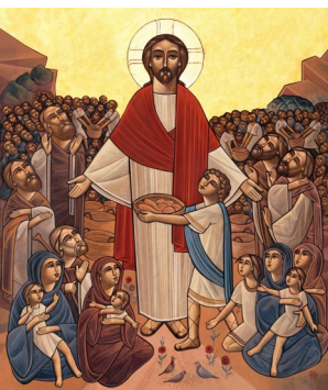
Multiplication of 5 loaves, 2 fish