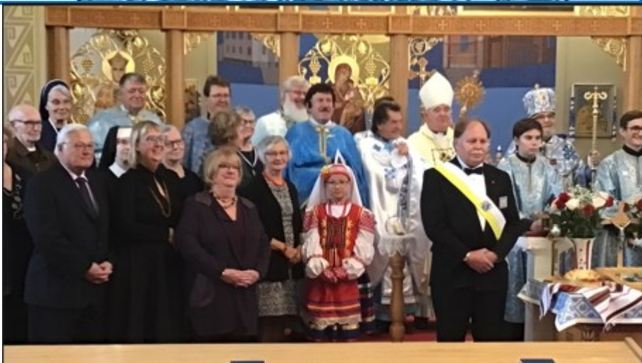
Above: a snapshot from our 100th Anniversary Divine Liturgy