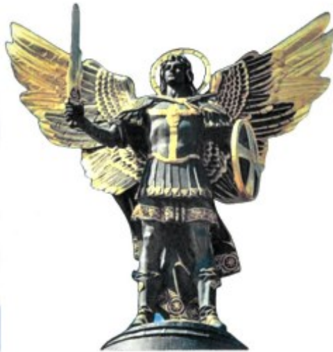
St. Michael the Archangel Patron Saint of Ukraine and the capital Kyiv

May the Mother of God once again spread her mantle over all Ukraine as she did once at Pochaiv and may Saint Michael the Archangel defend Ukraine in battle from all evil. We place our hope in You Lord. We trust in Your Will. Amen.