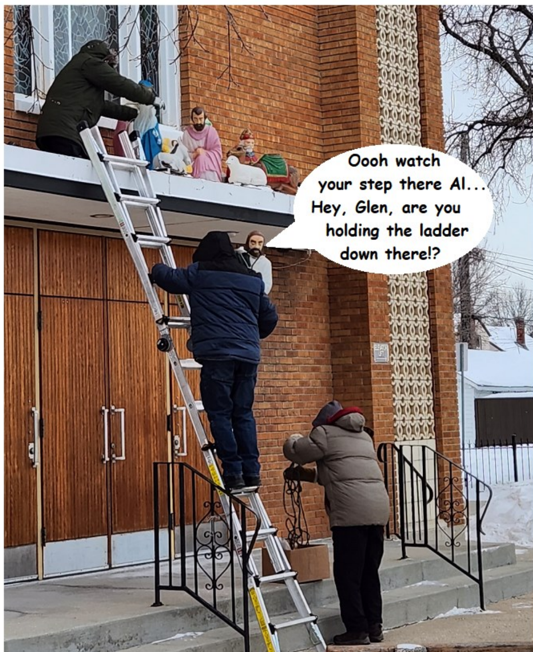
Members of the Men's Club take down the 2022 outdoor Nativity scene