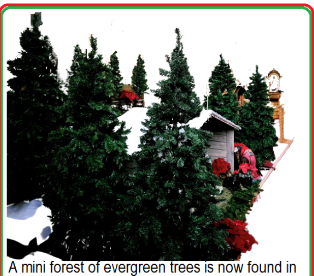
the northwest corner of our church... come this Christmas season to contemplate the wonderful peaceful scene in its midst!

Christmas season. God bless the Knights for arranging this! God bless everyone who came out!