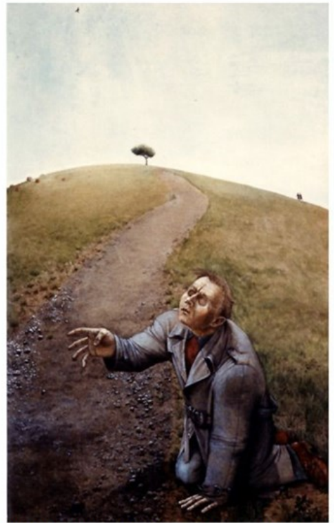
"Lord that I may see" - a 1955 painting by famous Ukrainian-Canadian artist William Kurelek as he started his journey to the Catholic Faith

And.... I want to take this opportunity to say Thanks, Дякую! to all who gave a "Christmas gift for the clergy" over the holidays. Some of you gave a little something in the yellow envelopes (the contents of which will be shared with our Metropolitan); some gave other things, like chocolates and other goodies (those might not be shared.. 😊) Know, however, that I am extremely grateful for your goodness, and I remember you and your families in my prayer continuously.